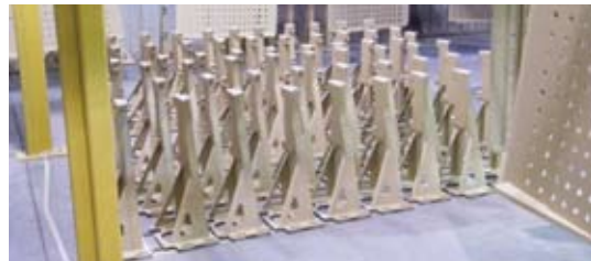
Interior CARC - Seat Brackets MRAP Program