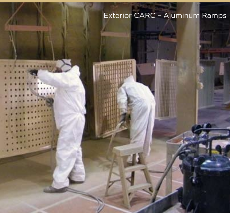
Exterior CARC - Aluminum Ramps

The goal of BOSS is to be the leader in the application of high quality coatings that provide the best value for our customers and contribute to our mutual success. We will accomplish this by providing products and services that meet or exceed the expectations of our customers through our total commitment to continuous improvement in everything we do.