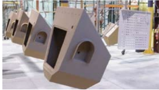
Exterior CARC - Storage Bins MRAP Program